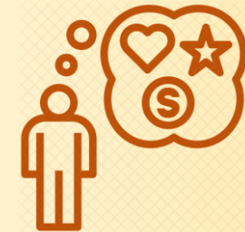
CUSTOMISED TO YOUR NEED